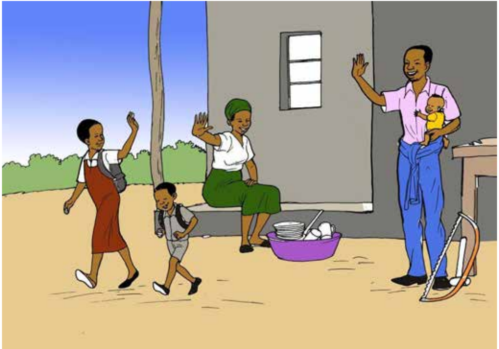
Illustration by R. Chilemba