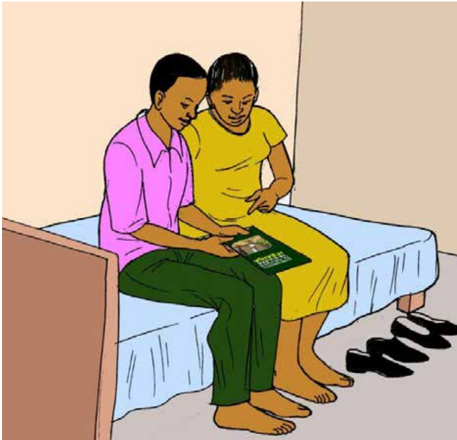
Banja la chikondi kukambirana za kulera.

Zotsatira za kafukufuku zimenezi ndi zofunikira kwambiri pofuna kuthandiza anthu a m’banja kuti azitsata bwino njira zakulera zachilengedwe zomwe Mpingo wa Katolika umaphunzitsa. Ndi chachidziwikire kuti alangizi a mabanja ali ndi udindo wofunikira wotheandiza anthu kumvetsa za m’mene nyengo za m’thupi la munthu wamai zimayendera.